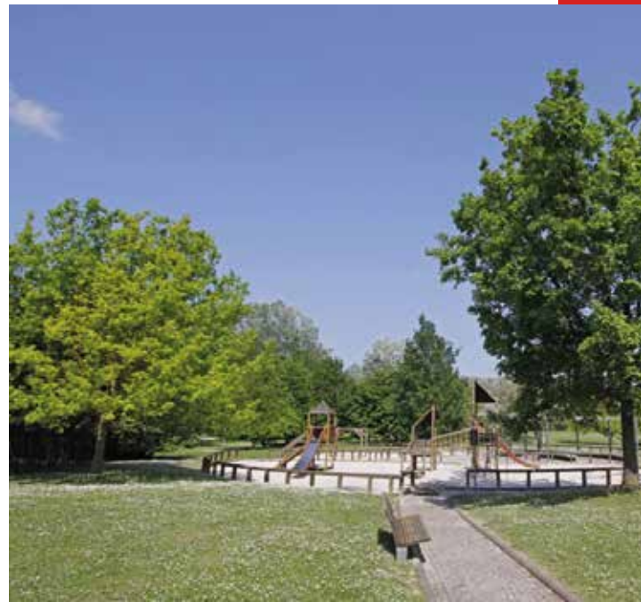
Parco Urbano Franco Agosto

Just a short distance from Piazza Saffi main square, it is worth spending some hours at "Franco Agosto" City Park, a unique green area in Italy - in part due to its position in the urban fabric next to the old city walls - for its botanical variety and for its size. The park covers a large surface, bordered by the Montone River and the green area belonging to the City Hospital (Pierantoni). It is perfectly equipped for any requirement: restaurants, bars, children's play areas, sporting facilities, refreshment spots, entertainment and leisure opportunities round out the offerings of the park.