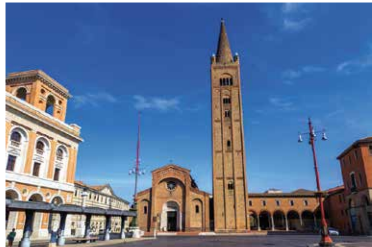
Basilica di San Mercuriale