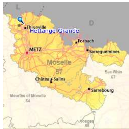
Plan de la Ville de Hettange-Grande/Sœttrich