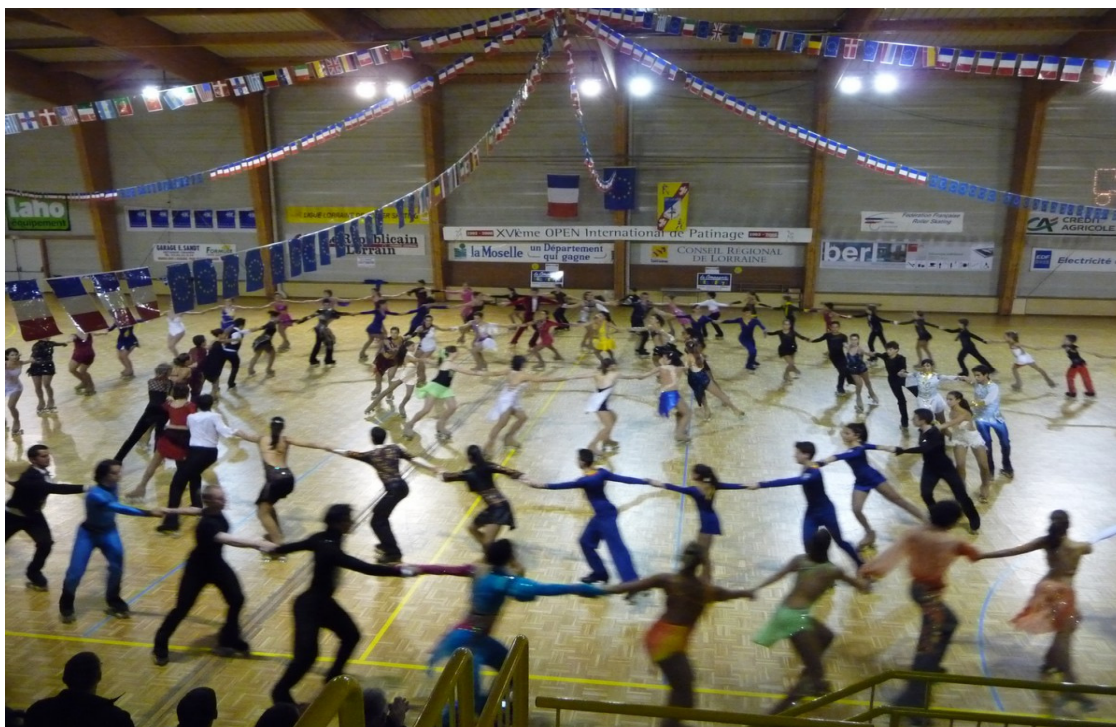
46m X 26m, WOODEN flooring.