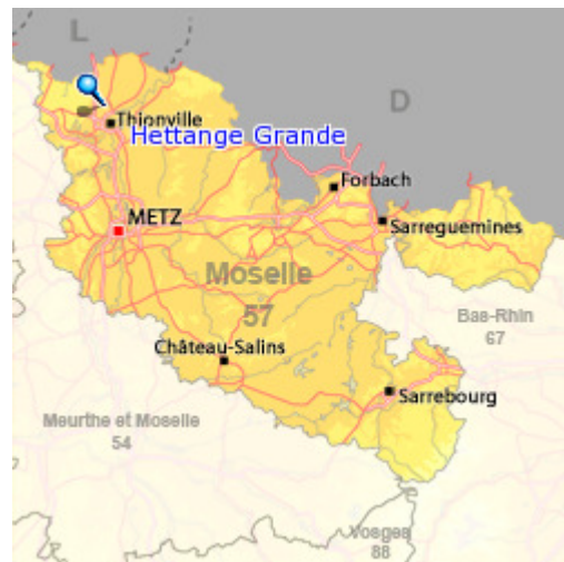
Plan de la Ville de Hettange-Grande/Soétrich